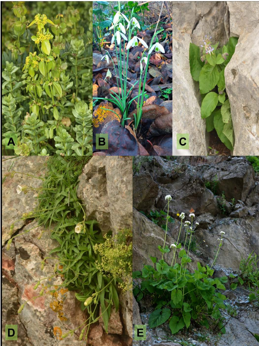
Fig. 1. (A) Crucjata taurica s.l. on Mt. Iti (photo by P. Trigas), (B) Galanthus reginae-olgae subsp. vernalis from the island of Lefkada (photo by K. Katopodis), (C) Symphytum creticum growing in a rock crevice on the island of Evvia (photo by E. Kalogiannis), (D) Silene auriculata subsp. auriculata in its natural habitat on Mt. Ortari, Evvia (photo by E. Kalogiannis), and (E) Valeriana alliarifolia on Mt. Xirovouni, Evvia (photo by E. Kalpoutzakis).

According to the above cited evidence, the distribution range of C. taurica s.l. in Greece is wider than previously thought and its populations show remarkable variation in several morphological characters, worthy of further investigation. Yet, the absence of caryological data, especially regarding the ploidy level of the Greek populations, and the incomplete knowledge of morphological variation found in all Greek localities do not allow a revision of this critical species at present. Thus, we preliminary include plants from Mt. Iti in Crucjata taurica s.l., and further research is scheduled in the future.