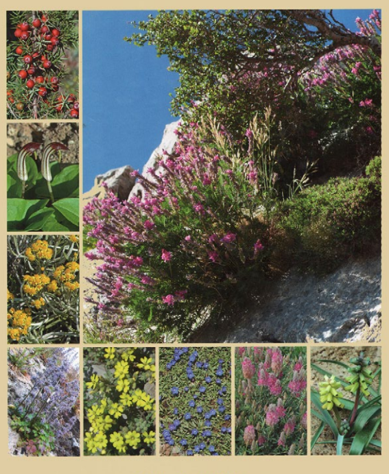
Part 1: Text & Plates