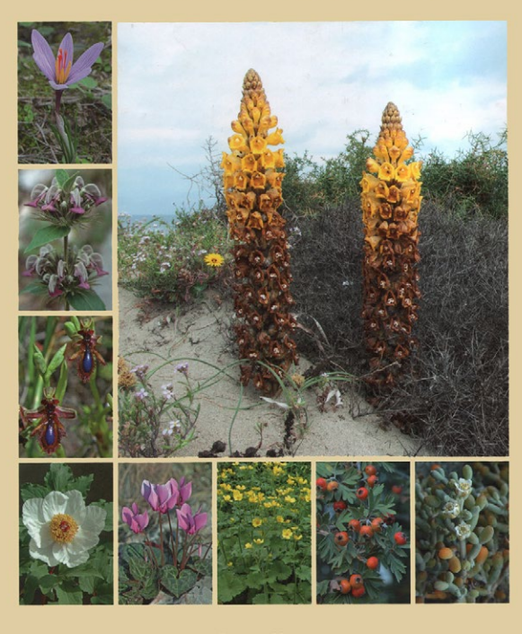
Part 2: Maps