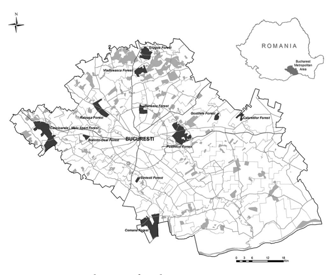
Fig. 1. Forests in the area of study.

The area studied was located in the eastern part of Bucharest within the Romanian Plain (Fig. 1).