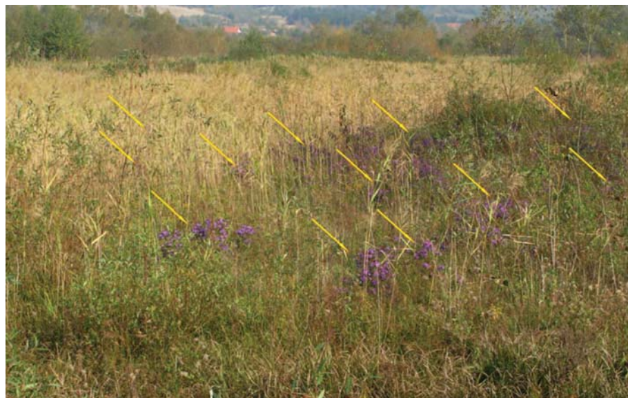
Fig. 3. Naturalized habitat of Symphotrichum novae-angliae in Serbia. Reedbed - Phragmites communis, Petrovac na Mlavi, Ždrelo, 44°23.329 N, 21°31.129 E (11.10.2010,). Symbols: yellow arrow – position of individual plants.