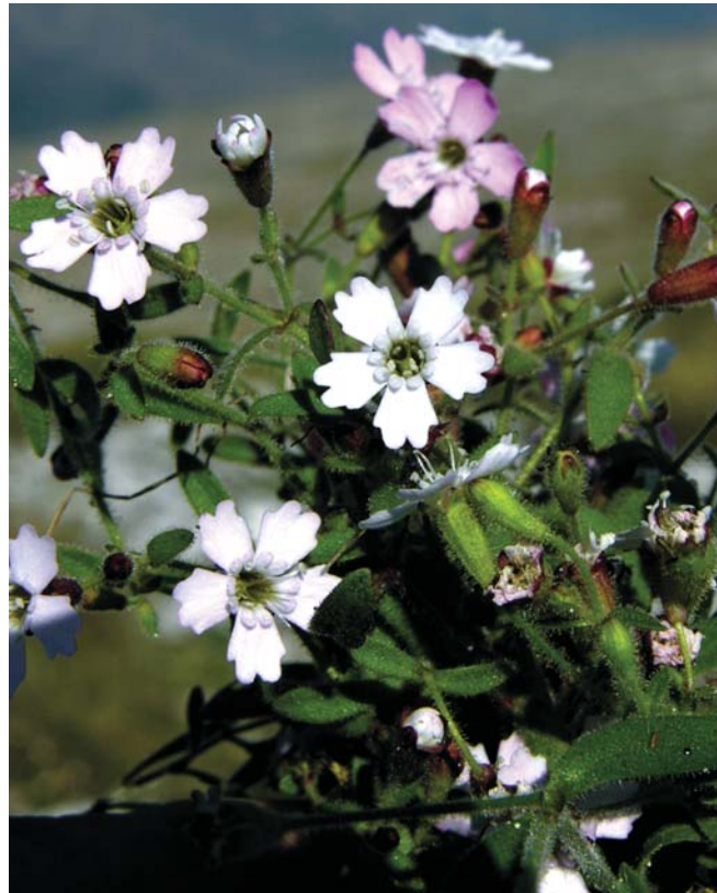
Fig. 3. Heliosperma pusillum subsp. monachorum from Mt Nemërçka.

Cymbalaria microcalyx (Boiss.) Wettst. subsp. minor (Cuf.) Greuter (Fig. 4)