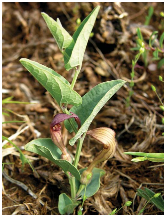
Fig. 1. Aristolochia merxmuelleri from Surroj area.

Minuartia pseudosaxifraga (Mattf.) Greuter & Burdet (Fig. 2)