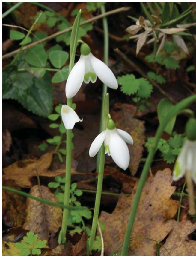
Fig. 5. Galanthus reginae-olgae subsp. reginae-olgae from Bistricea valley.