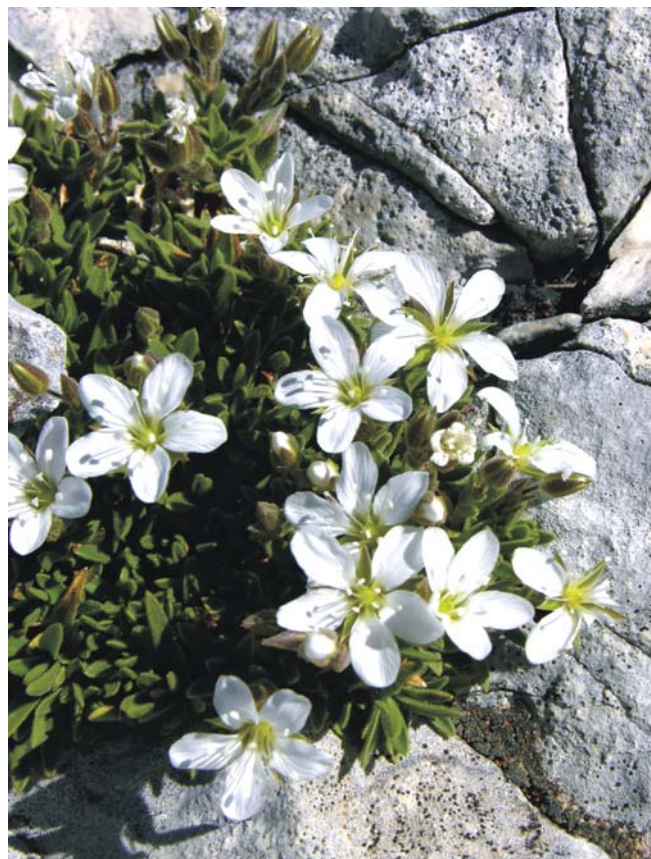
Fig. 2. Minuartia pseudosaxifraga from Mt Nemërçka.

S Albania: Gjirokastra district, Mt Nemërçka, shady rock ledges and crevices, limestone, 2200-2450 m, 40°07'N, 20°24'E, 20 June 2007, Shuka & Malo 3218 (TIR), loc. ibid., Shuka & Malo 3221 (herb. Kit), loc. ibid., Shuka & Malo 3219 & 3220 (herb. Shuka).