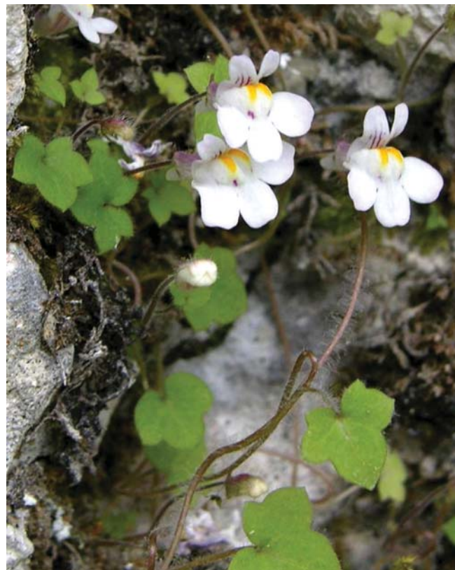
Fig. 4. Cymbalaria microcalyx subsp. minor from Kardhiqi valley.

A trip was made to the northern Albanian Alps with the intention of monitoring known populations of Wulfenia baldacci Degen and Petasites doerfleri Hayek on Buni i Thores. The Pedicularis was discovered in the area, not surprising bearing in mind the not too distant locality of the Kosovo Alps (Mt Prokletije) from where it was