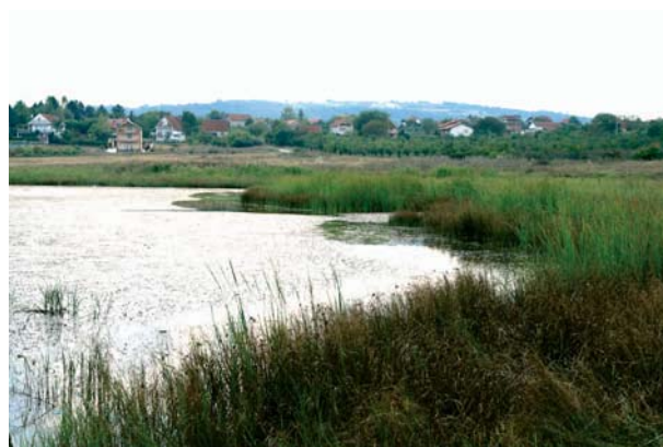
Fig. 3 Habitat of Typha domingensis (Niš-Dobrič valley, Oblačina Salt area, relic remain of Lake Oblačinsko)