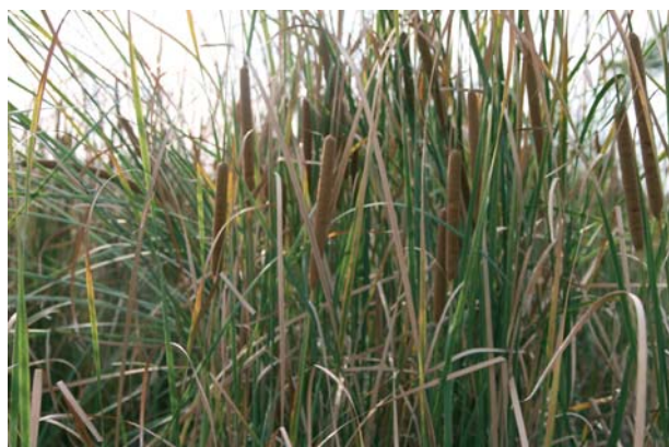
Fig. 1 Typha domingensis (Niš-Dobrič valley, Oblačina Salt area, relic remain of Lake Oblačinsko)

Typha domingensis is sometimes confused with T. angustifolia , which has on an average narrower leaves and spikes, and usually auriculate top of leaf sheaths without or with scattered glands. However, already from a distance T. domingensis is usually easy to recognize of the spike color: its spikes are light brown, whereas T. angustifolia has darker cinnamon brown (but not blackish brown) spikes. The