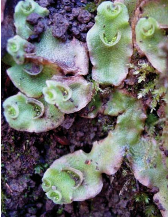
Fig. 1. Lunularia cruciata in Gradac river gorge (Serbia).

introductions were Lunularia cruciata (1828, Karlsruhe, Germany; FRAHM 1973). BIGGS & WITTKUHN (2006) documented the presence of L. cruciata gemmae in the bryophyte diaspore bank in soil and litter of an urban bush land in Perth, Australia.