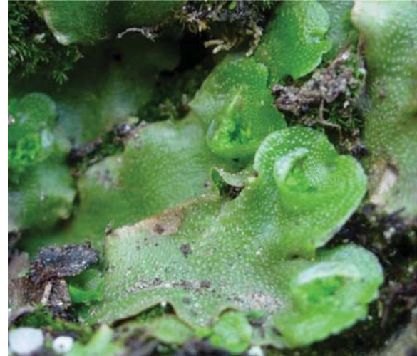
Fig. 2. Lunularia cruciata with characteristic crescent gemmae cup

The influence of climate changes, ie. mean temperature changes, on cryptogams has rarely been considered even though they are proved to be more sensitive to environmental fluctuations. FRAHM & KLAUS (1997, 2001) described an extension of the ranges of 30 species, previously distributed in western and southern Europe into Central Europe, for several hundred kilometers to the east